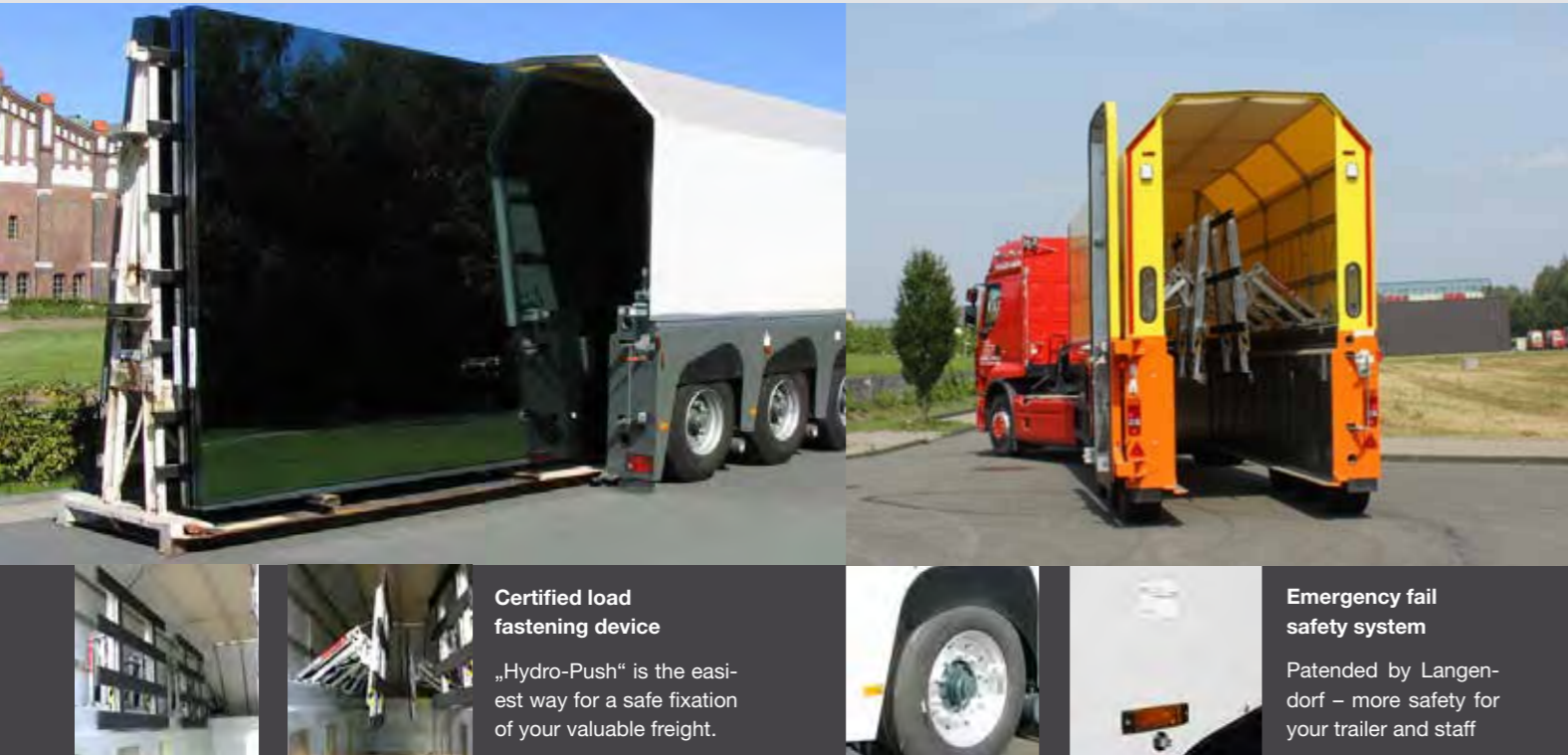
Certified load fastening device

„Hydro-Push“ is the easiest way for a safe fixation of your valuable freight.