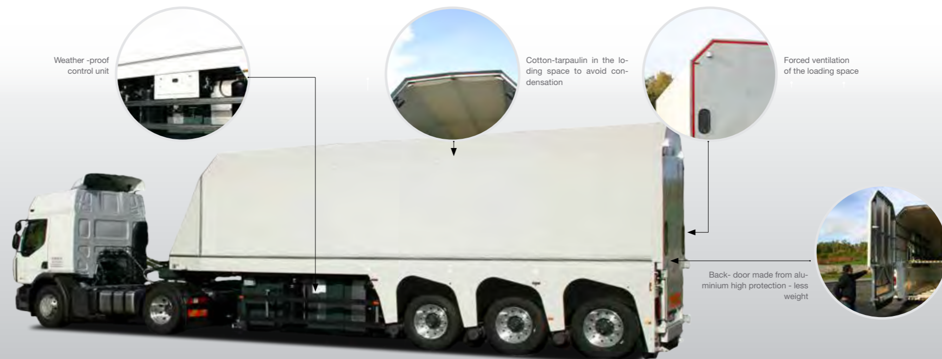
Weather -proof control unit

The own construction of our axle benefits from decades of experience in various fields of application – worldwide.